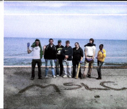
Hamlin Beach Clean-up